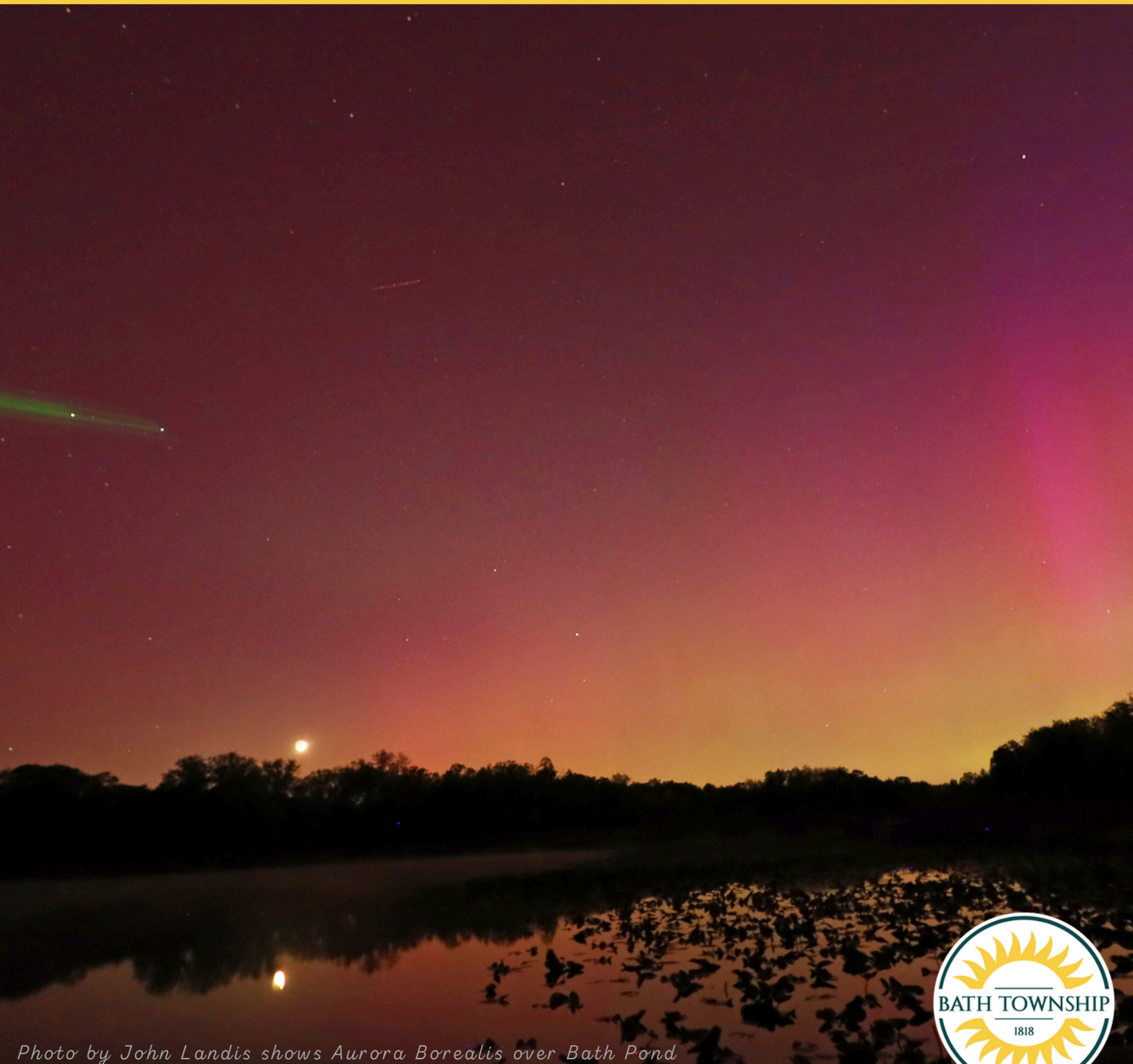
shows Aurora Borealis over Bath Pond